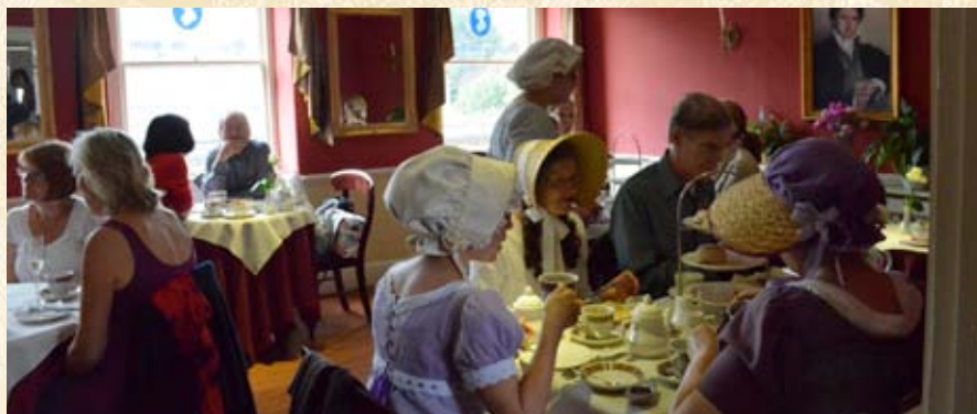
Jane Austen Tea Rooms, Bath