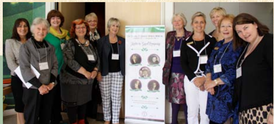
Photo: Members of the SWW Literary Festival subcommittee. There are more photos from the day on p5 and there will be a full roundup of the festival in the Summer edition of Women's Ink!