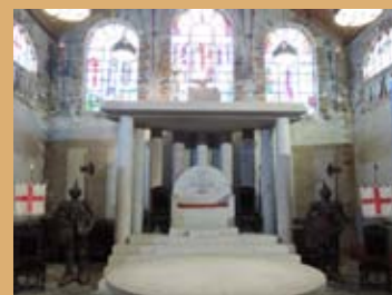
Great Hall at Tintagel